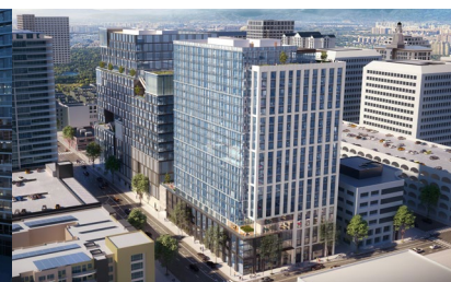
ECHO Multifamily | 388 Units