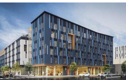
GIFFORD PLACE Assisted Living | 169 Units

No Depreciation Recapture: Fund II is an LLC, and thus a pass through entity. Investors will benefit from any depreciation that occurs on the properties through pass through losses. Typically, when a property sells, investors are required to pay the government back all of those losses through depreciation recapture. There is no federal depreciation recapture for opportunity zone funds, so investors are able to keep these losses.