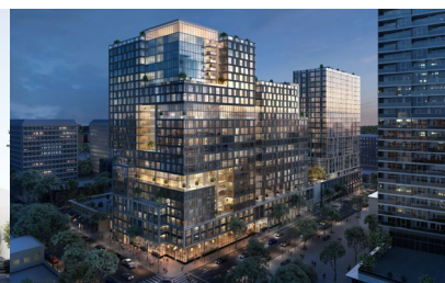
ICON 3 Multifamily | 650+/- Units